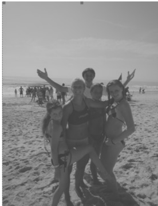
Monterey Beach Junior Lifeguards 2009